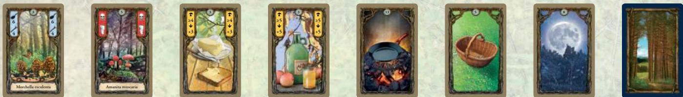
Morels Fly agaric Butter Cidre Pan Basket Moon Back