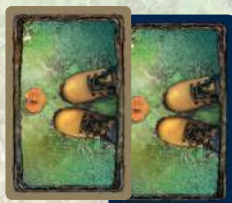
1 Pair of Shoes