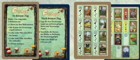
6 Overview Cards