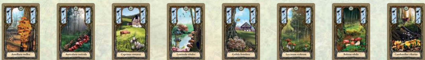
Honey fungus Tree Ear Lawyer's Wig Shiitake Hen of the Woods Birch bolete Porcini Chanterelle