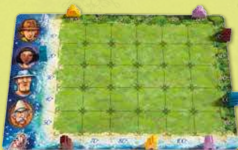
Here is what the islands could look like